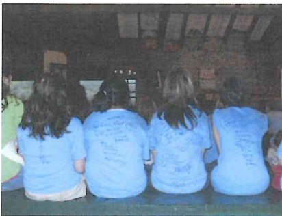
Campers and Staff Summer 2010